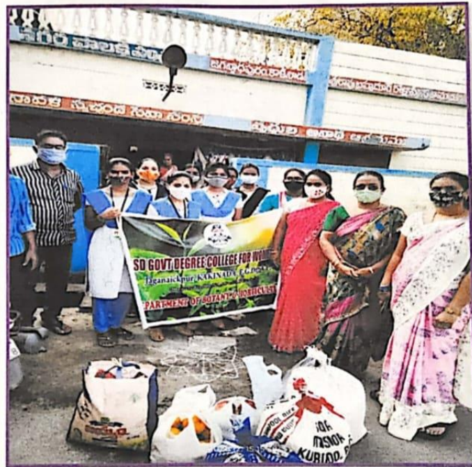
Students & Faculty visited Janavali Old age Home, Jagannavekpur Kakirada. 15-12-2021